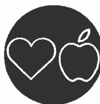
Health and Wellness