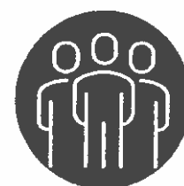
Character and Leadership

The Health and Wellness pillar is designed to improve access to better health outcomes for individuals and families.